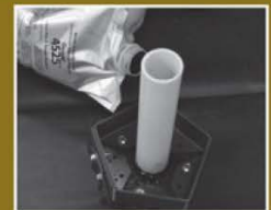
Fill Pocket 4525 Sealant