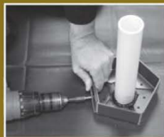
Secure Around Penetration