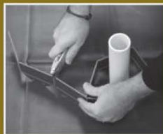
Cut Pocket to Length