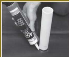
Seal Penetration 4500 Sealant