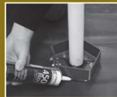
Seal Pocket 4500 Sealant